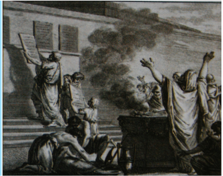
Primary Source: The Roman Forum

The Roman Forum was a collection of buildings that stood at the heart of ancient Rome. Buildings included temples, monuments, and the Curia- the meeting place of the Roman Senate. The Twelve Tables were displayed in the Forum so that everyone would know what the laws were.